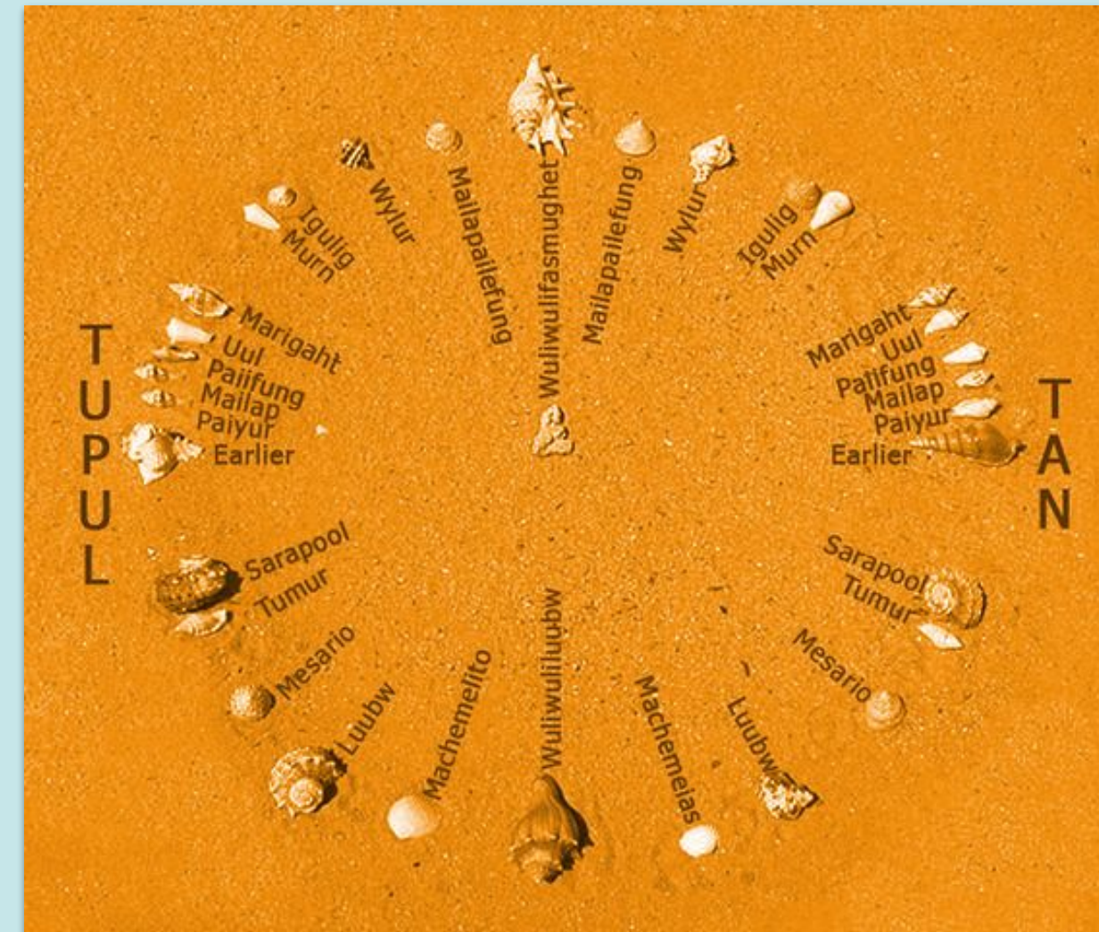
(left) Satawalese star map. Shells represent specific constellations, splitting the circle into 32 'houses.' Each one was 11.25° & the degrees translated into miles (1° = 60mi). Distance could be measured with hands referencing degrees (below)

During the day, the sun & clouds are just as important to predict weather patterns & direction.